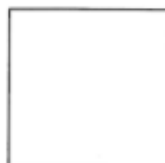
Photograph of the applicant

Application format for engagement of Young Professional in Ministry of Civil Aviation